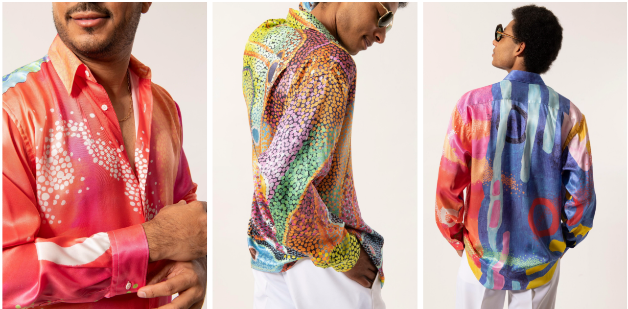
Photo credits: Ricardo Bernardino x Michel Deville Sea to Silk Collection . Photo: Eric Rossier