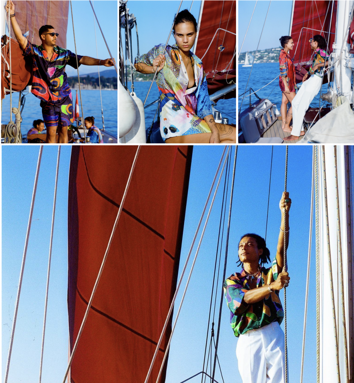
Photo credits: Ricardo Bernardino x Michel Deville Sea to Silk Collection . Photo: Laureat Bakolli